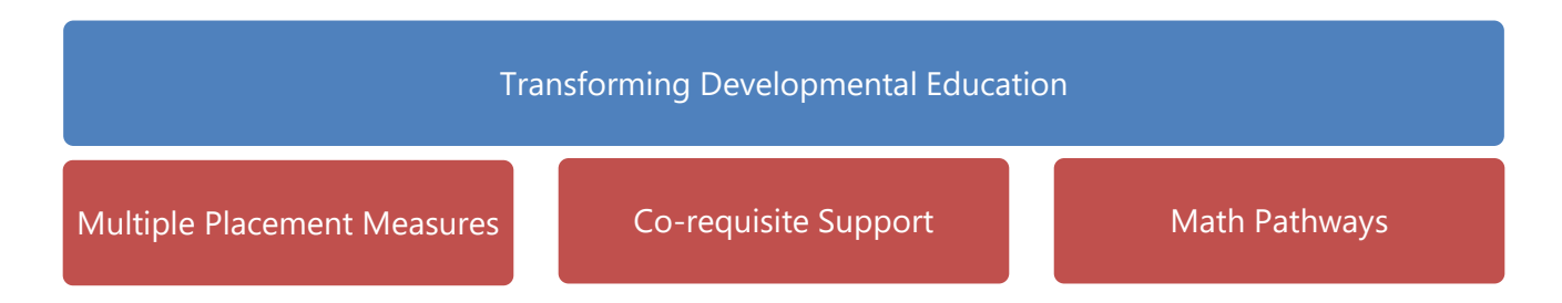
Figure 1: Three-Pronged Approach for Transforming Developmental Education in Massachusetts

This comprehensive strategy seeks to assess students properly for credit-bearing courses using multiple measures; ensure that students are taking and completing the appropriate math for their major; and give students who require remediation access to co-requisite support in English and mathematics courses. The approach was developed in the first phase of this work, which included convening the Task Force on Transforming Developmental Mathematics Education. The second phase consisted of advancing the recommendations of the Task Force and campus experimentation. The third and current phase marks a transition from pilot to policy. The first policy under the transforming developmental education umbrella was advanced by the Board in January 2018 with the acceptance of the Designing Math Pathways Report and endorsement of its recommendations. The GPA policy was approved by the Board in December 2018 to allow for the use of a 2.7 cumulative high school GPA to place a student directly into college-level English and mathematics courses also seeks to transition from simply piloting the use of GPA to formalizing it as a placement measure by amending the 1998 Common Assessment Policy.